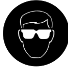
Wear Eye Protection