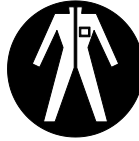
Wear Protective Clothing