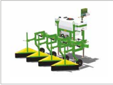
Varidome S1 CDA with a 100 litre Tank System and LW carriages for herbs.