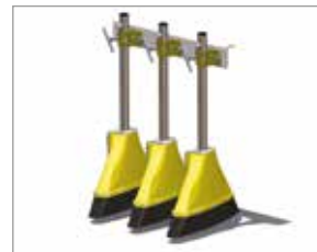
Varidome 100 HiFlo (triple)