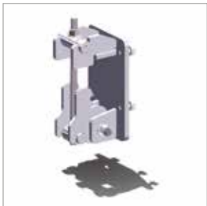
Quick Release Clamp