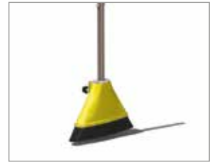
Varidome 100 HiFlo