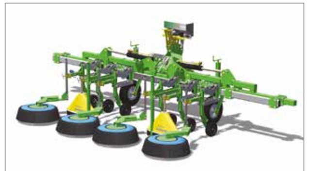
Varidome S3 asparagus model specified with UD600 HiFlo and 170 HiFlo shields with HD carriages.