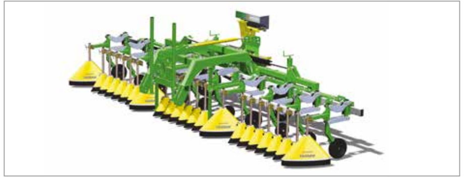
Front mounted Varidome S3 fitted with HD carriages and a combination of 100 HiFlo and 170 HiFlo shields for operation in salad onions.