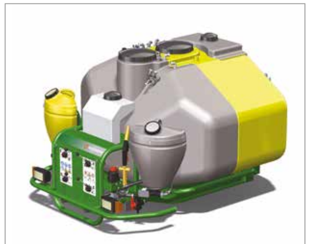
Dual Tank System 1800L