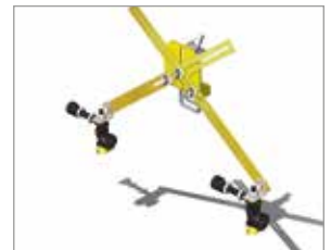
Second Spray Line