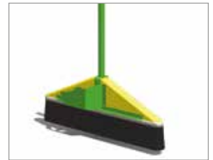
Varidome 80 CDA