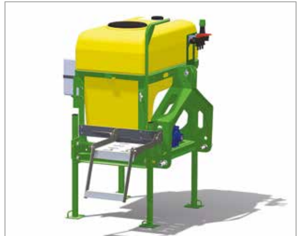
Tank System 400L