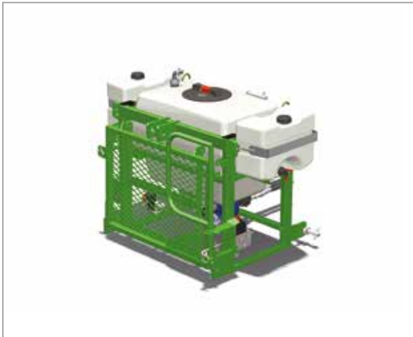
Tank System 100L

Dual Tank System 1800L. With the combined volume capacity of 1800 litres, Micron's innovative Dual Tank System 1800L incorporates 1050 and 750 litre reservoirs which feature independent twin spray systems with hydraulic centrifugal self-priming pumps, induction hoppers with agitation and rinse facilities and road lighting. Designed for the simultaneous application of two separate products in the inter-row and over the row, the Micron Dual Tank offers users flexibility and increased productivity.