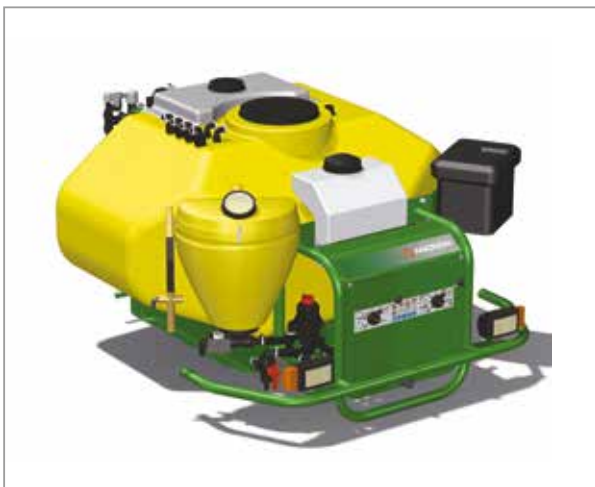
Tank System 1200L