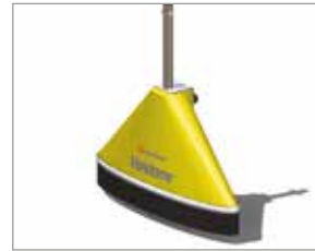
Varidome 170 HiFlo

Sprayers can be fitted with a single spray line for inter-row weed control or a dual system for simultaneous application of two different products.