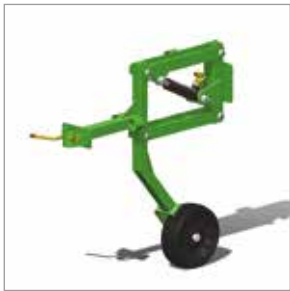
Lightweight Carriage 230mm Wheel