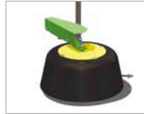
Varidome UD HiFlo