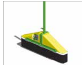
Varidome 130 CDA