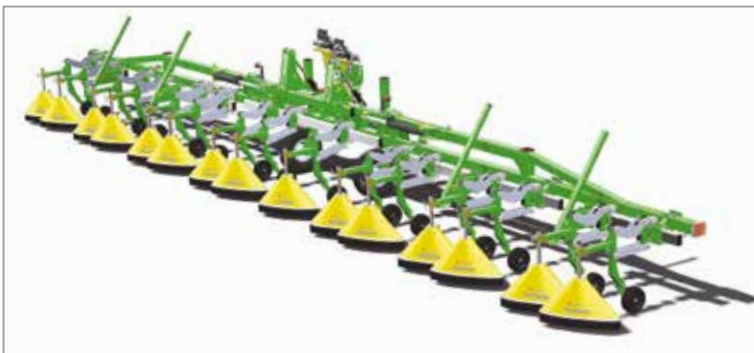
Varidome S7 with overlapping 170 HiFlo shield configuration for sugar cane.