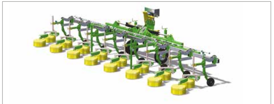
Varidome S3 for strawberries, equipped with twin SD400 HiFlo domes on HD carriages.