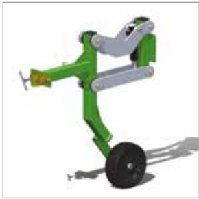
Heavy Duty Carriage 230mm Wheel

Carriages can be fixed to the toolbar using a standard clamp or an optional quick release system which allows for easy and rapid repositioning of the carriages.