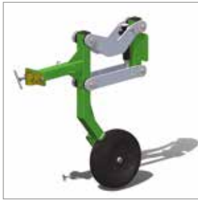
Heavy Duty Carriage 300mm Wheel