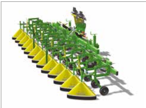
Varidome S3 with LW carriages, 170 HiFlo shields and Micron Dual Spray System for sugar beet.