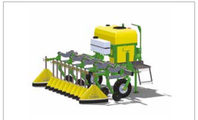
Varidome S1 configured with a 300 litre Tank System and a combination of 100 HiFlo and 170 HiFlo shields on HD carriages for beetroot.